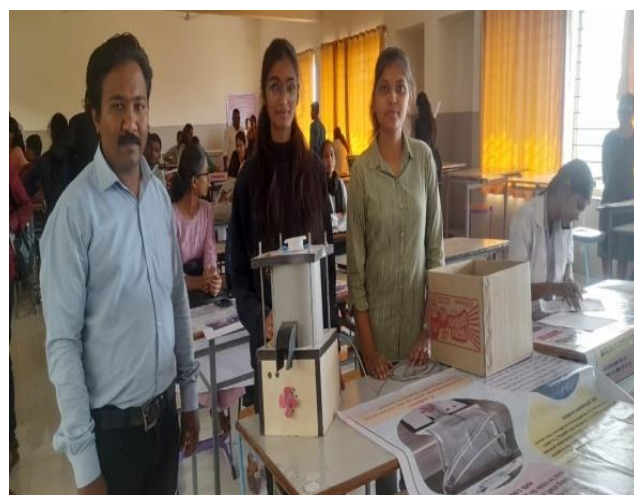
Students presenting their model